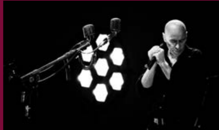
Director: Tim Pope Year: 2021 Country: UK Duration: 120m

Tim Pope's beautifully shot, unobtrusive film of THE THE's 2018 Royal Albert Hall concert, documents the first of a trio of London shows during The Comeback Special tour - all of which sold out within minutes of going on sale. Performing live for the first time in 16 years, the rejuvenated THE THE would go on to play sold-out shows and make festival headline appearances across the globe throughout 2018.