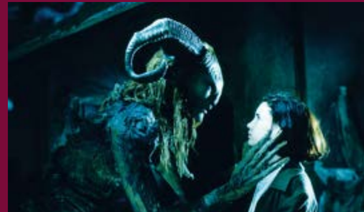
Director: Guillermo del Toro Year: 2006 Country: Spain Duration: 119m Starring: Ivana Baquero, Doug Jones

An illustrated talk + Q&A followed by a screening of Pan's Labyrinth at 2pm