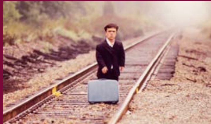
Director: Thomas McCarthy Year: 2003 Country: USA Duration: 86m Starring: Bobby Cannavale, Patricia Clarkson, Peter Dinklage

Finbar McBride is a four-foot-tall, lonely man who chooses to live the life of a hermit in an abandoned train yard in New Jersey, following the death of his friend. There, he unexpectedly meets and befriends a couple of fellow loners - troubled artist Olivia, and carefree and friendly Joe. The three unlikely friends each deal with their urge to connect compared with their individual need for isolation.