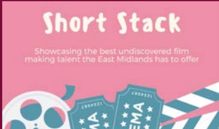
Directors: Various Year: 2020/21 Country: UK Duration: 90m

Short Stack returns, showcasing the best short films, music videos and documentaries the East Midlands has to offer. If you like your films short and snappy and want to support some home-grown talent, Short Stack is the place to be.