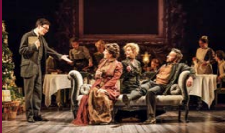
Duration: 140m A new play by Tom Stoppard Directed by Patrick Marber

Tom Stoppard's Olivier Award-winning new play Leopoldstadt is a passionate drama of love, family and endurance. At the beginning of the 20th century, Leopoldstadt was the old, crowded Jewish quarter of Vienna, Austria. We follow one family's story across half a century, passing through the convulsions of war, revolution, impoverishment, annexation by Nazi Germany and the Holocaust. A company of 40 actors represent each generation of the family in this epic, but intimate play.